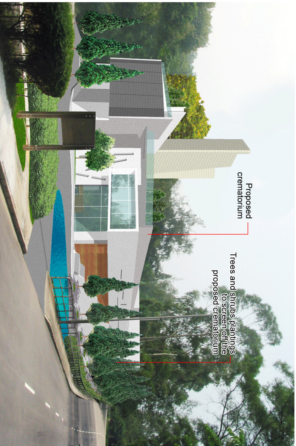
Photo 3: View from Kiu Tau Road with Mitigation Measures on Day 1 of Operation