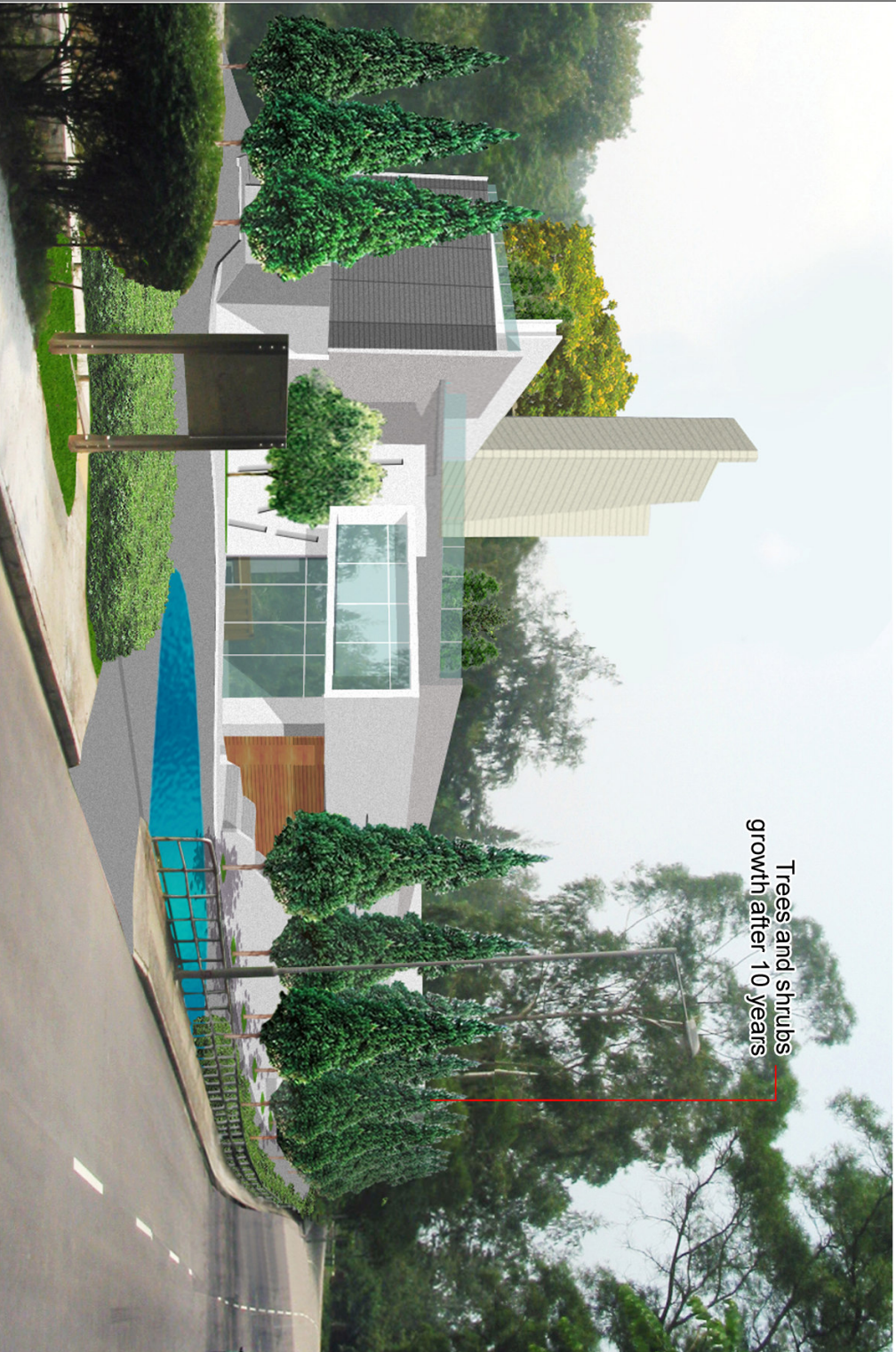
Trees and shrubs growth after 10 years